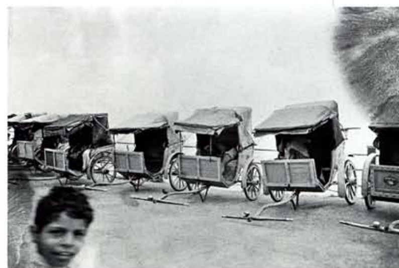
Sleeping rickshaw-pullers, Mussoorie, c.1964

A book of his writings on art and his poetry will follow shortly after. This exercise has been delayed by nearly a quarter of a century. But it is still not too late to complete the cycle of his life by bringing back the man and his context for the generation that lives on now. ➔