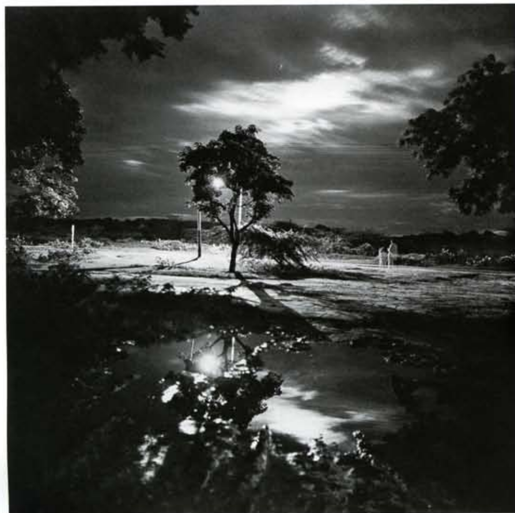
Moonlit night, Old Delhi, c.1956 (left)